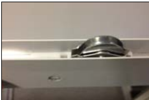
Steel Face Adjust Roller