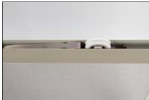
Plastic Spring Roller