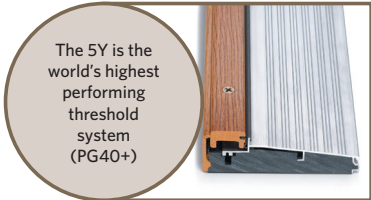
The 5Y is the world's highest performing threshold system (PG40+)