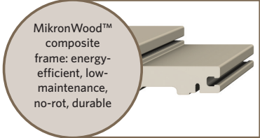
MikronWood™ composite frame: energy-efficient, low-maintenance, no-rot, durable

Imperial Products by Homeshield, a Quanex Building Products company, offers a complete suite of high-performance door products, including thresholds, astragals, weather seals, door jambs and multipoint locks that are designed to provide simplicity, improve energy performance and reduce or eliminate air and water infiltration.