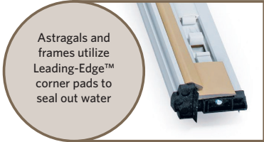
Astragals and frames utilize Leading-Edge™ corner pads to seal out water