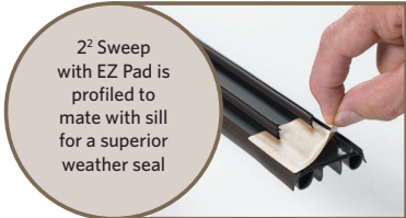
2" Sweep with EZ Pad is profiled to mate with sill for a superior weather seal