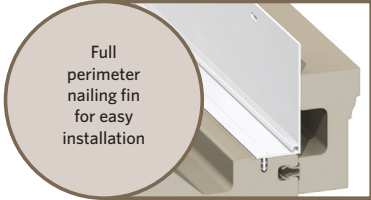
Full perimeter nailing fin for easy installation